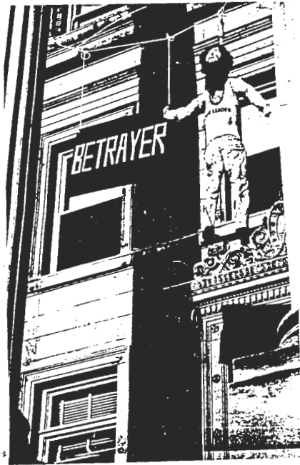
UNIDENTIFIED PERSONS or a person early Friday morning hung an effigy of GSB President Don Smith from the east columns of Beardshear Hall. The life size figure dangled there until shortly after 8 a.m. when a crew from the Physical Plant cut it down. The effigy, which greeted students on their way to morning classes, was outfitted in sweatshirt, blue jeans and wing-tip shoes with no laces.